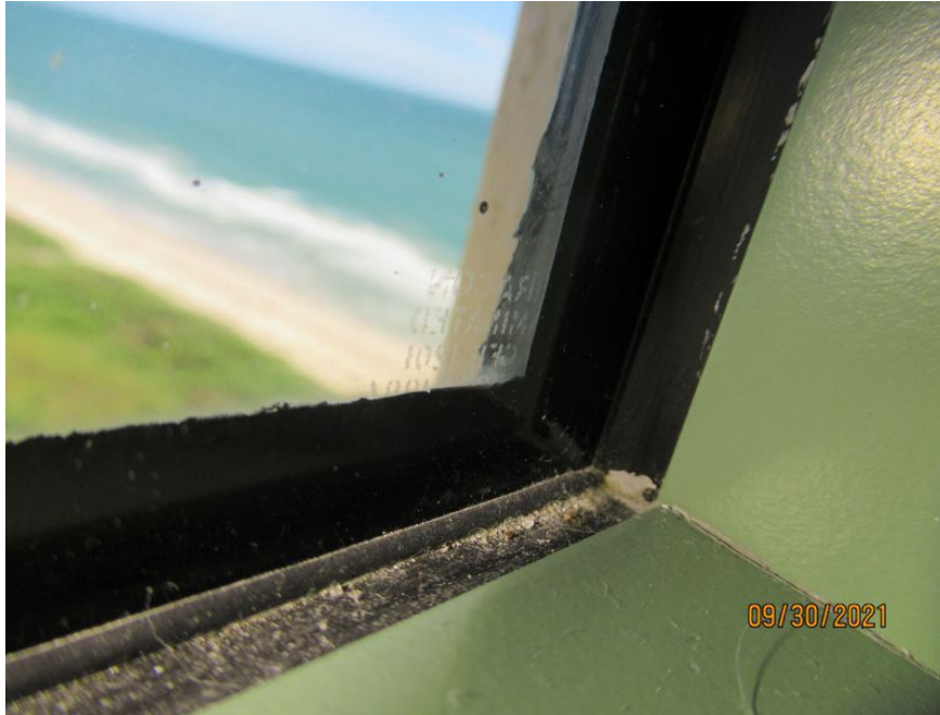
Impact Rated Glass Window Etching/engraving