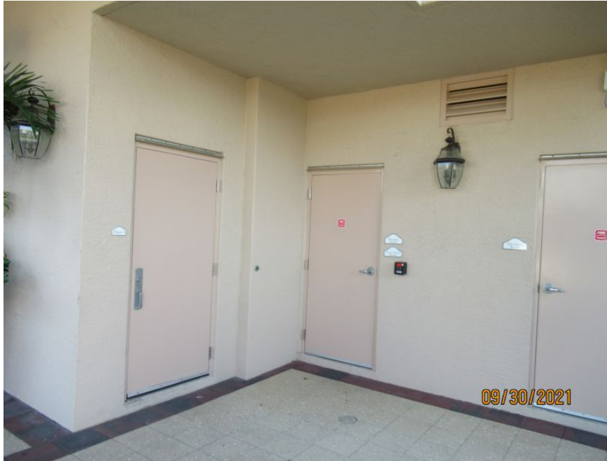
Solid Entry Doors