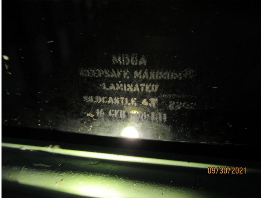
Impact Rated Glass Door Etching/engraving