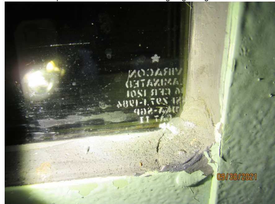
Impact Rated Glass Window Etching/engraving