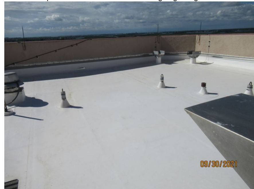
Membrane Tpo Roof Covering