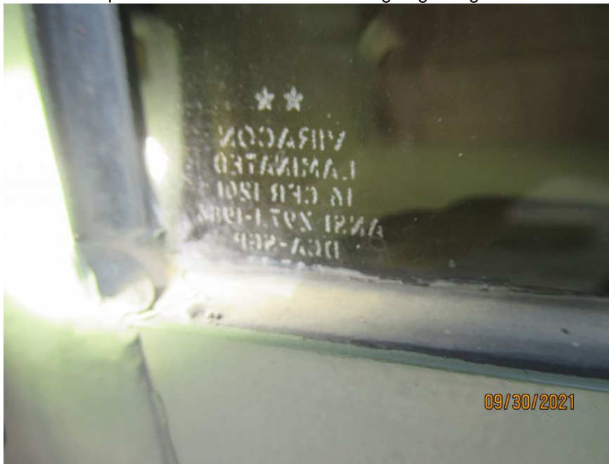
Impact Rated Glass Window Etching/engraving