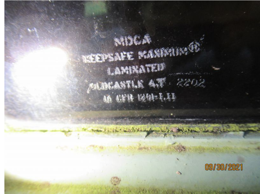
Impact Rated Glass Window Etching/engraving