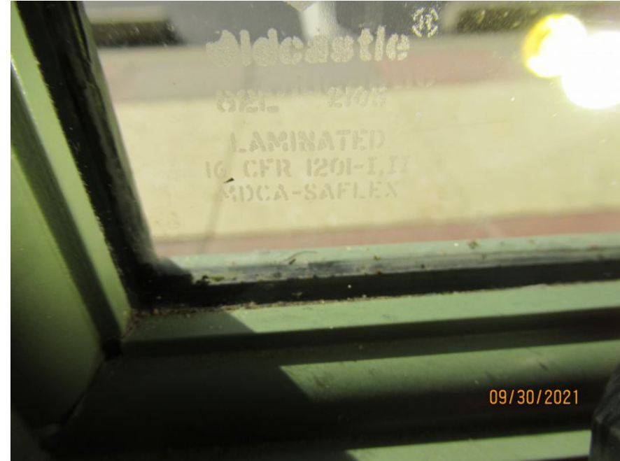
Impact Rated Glass Door Etching/engraving