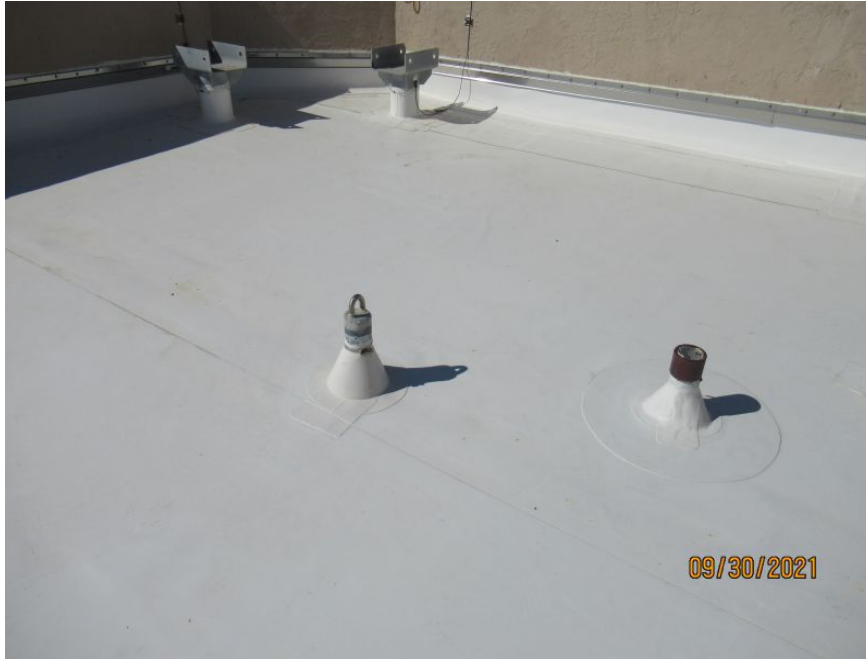
Membrane Tpo Roof Covering