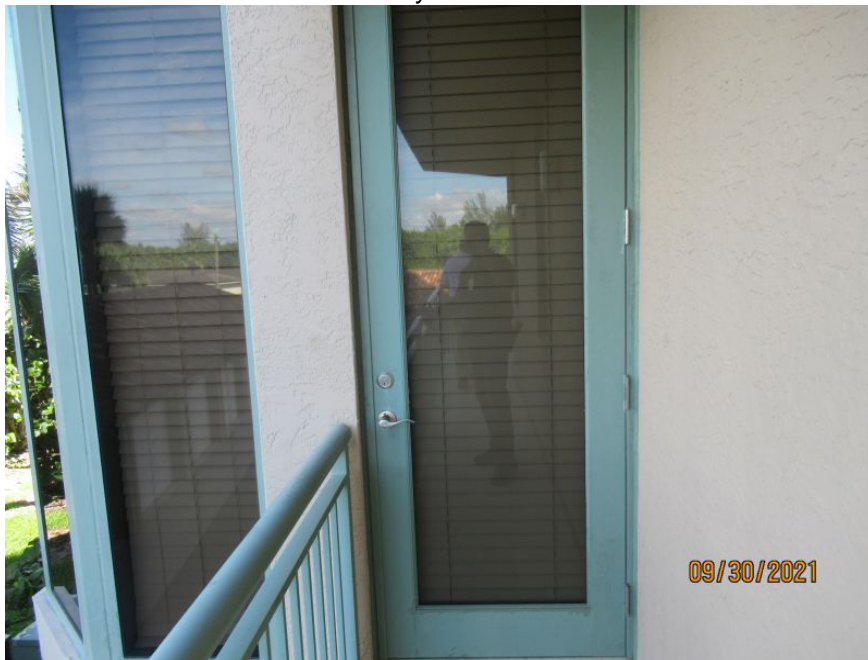
Impact Rated Glazed Door