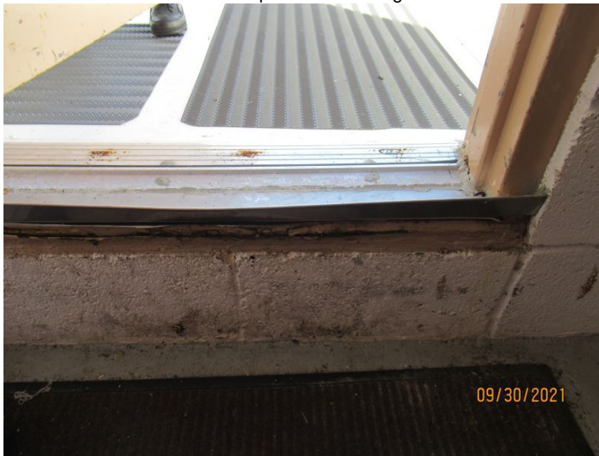
Structural: Reinforced Concrete