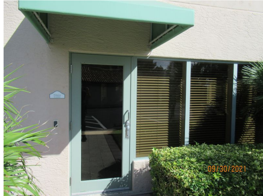
Impact Rated Glazed Door And Windows